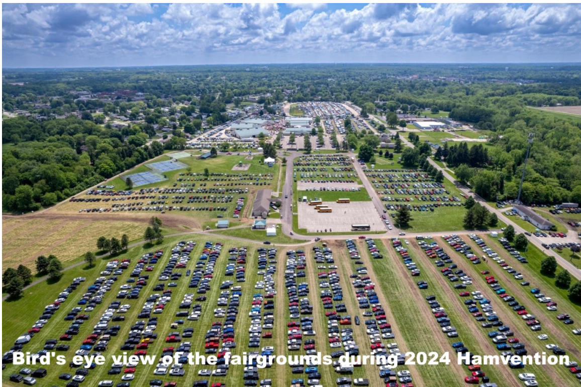
Bird's eye view of the fairgrounds during 2024 Hamvention

What we know today as the Dayton Hamvention® started in 1952 as the Southwestern Ohio Ham-vention sponsored by the Dayton Amateur Radio Association (DARA), and it took place at the Biltmore Hotel in downtown Dayton. In 1953 the event became known as the Dayton Hamvention® and the name became a registered trademark. In 1964, Dayton Hamvention® moved to the Hara Arena, and in 2020 the event moved to its current location...the Greene County Fairgrounds and Exposition Center in Xenia, Ohio. Throughout, DARA has sponsored this gathering of amateur radio operators. From its meager beginnings of a one-day affair with only 600 in attendance, it has grown into the world's largest amateur radio event -- this year bringing in 35,877 attendees – lasting three days.